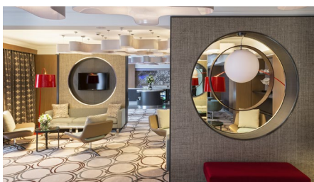
Comfortable surroundings - Pullman Executive Lounge